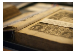
Archives of the University of Missouri School of Law

Law School Archives : Select and add images and text from the University of Missouri School of Law Archives in support of the mission of the Law School, particularly where it will aid in scholarship or Development activities.